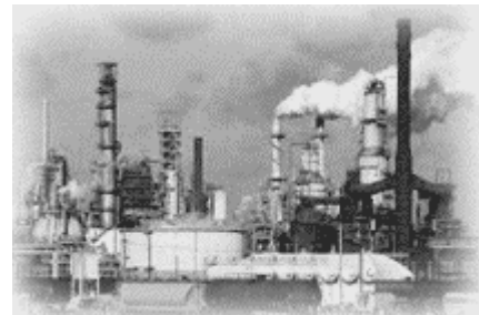
The Dudley Widget Works

Unfortunately, since the introduction of the shift system two years ago, things have not been going well. Worker sickness and absenteeism have increased markedly. There has also been an increase in the number of accidents occurring involving workers operating the widget-making machinery. The quality control department has also noticed that the number of poorly manufactured thingamabobs has increased. There are more complaints from customers than previously, and an unacceptably high number of thingamabobs is being rejected at the end of the production line. In addition, worker morale and satisfaction are at an all time low. As a result, staff turnover has increased. People stay with the company for less time, and more money and time than previously are being spent on staff recruitment and training.